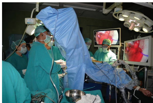
Figure 2: Team of surgeons simultaneously performing abdominal and rectal dissection in TaTME surgery.