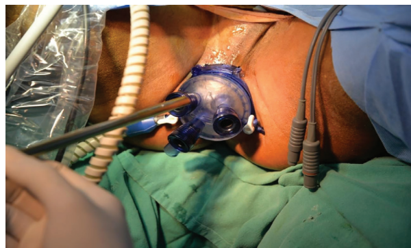
Figure 1: A GelPort was inserted in the rectum.