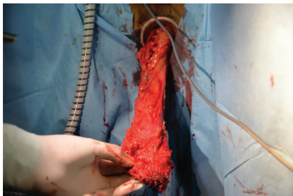
Figure 4: Transanal total mesorectal specimen delivered out through the anus.