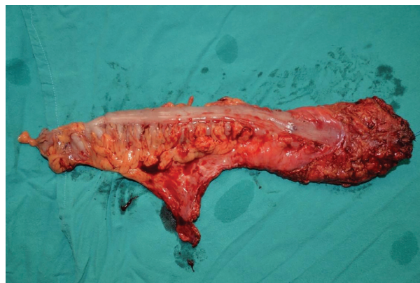
Figure 5: Quality of total mesorectal excision.

Out of the patients studied, 30 (85.7%) had