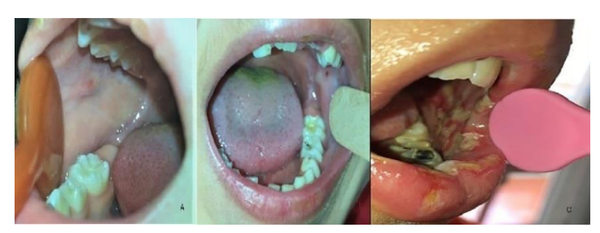
Figure 1: Severity of mucositis in patients, a: Grade 2 mucositis in the test group, b: Grade 2 mucositis in the control group, c: Grade 3 mucositis in the control group