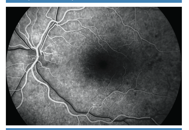
Figure 3: Fluorescein angiography (FA) shows subtle early hyperfluorescence of the dots with late staining.