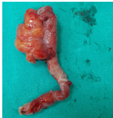
Figure 1: The macroscopic examination of the appendectomy material showed an area compatible with an appendix with a size of 10×0.8 cm and an acquired diverticulitis protruding 0.7 cm from the tip of the appendix.

Appendiceal diverticular disease is a rare condition first described by Kelynack in 1893 (1). Based on histopathological features, appendiceal diverticula are divided into two subtypes: true (congenital) and false (acquired) diverticula (2, 3). The incidence of congenital appendiceal diverticulitis is reportedly 0.014%, less than that of acquired appendiceal diverticulitis (1.9%) (3). Congenital diverticula are