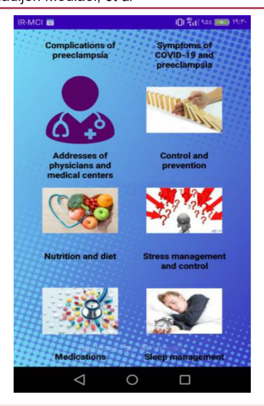
Figure 1: The main page of the self-care application for pregnant women with pre-eclampsia against COVID-19.