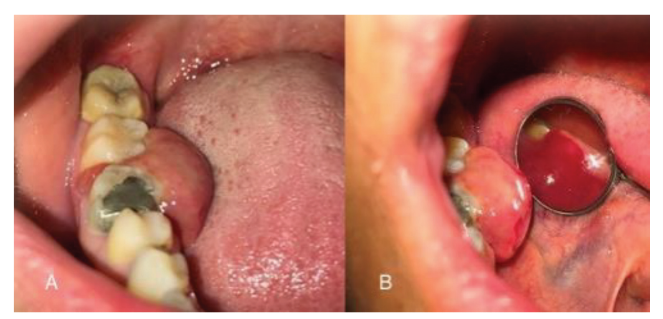
Figure 1. (A, B) Clinical examination showed a reddish-pink and homogenous gingival mass.

Oral cavity examination revealed a smooth, firm, reddish-pink, painless, homogenous, rapid growing gingival mass around the lingual side of teeth numbers 46 and 47, measuring about 2.5 \times 2 \times 1 cm, with an eroded surface (Figure 1. A, B). The mass was non-hemorrhagic and domeshaped. There was a small nodule on the buccal side of the interdental area (about 0.5 \times 0.5 cm). The second right mandibular molar (tooth number 47) had grade II mobility. The rest of the mouth was normal. The radiographic examination