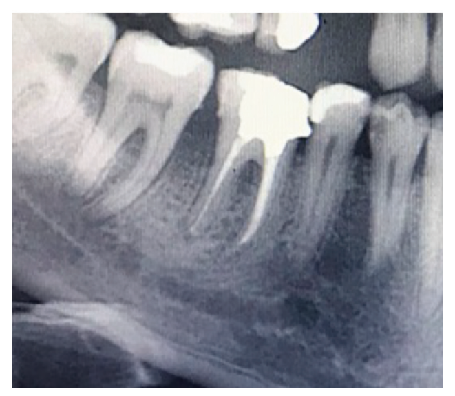
Figure 2. Radiographic examination showed an interdental rarefaction.

Subsequently, segmental bone resection was performed under general anesthesia. The extraoral cutaneous incision in the neck area was done starting from the submental region to the right mastoid, 2 cm below the mandibular angle. The next step involved a horizontal incision on the platysma to reach the right submandibular gland, followed by the ligation of the facial vein and artery. Upon pushing the submandibular gland further down, the base of the mandible became reachable from the menton to sigmoid notch area. Thereafter, a soft tissue intraoral incision with a 1 cm margin was done extending from the mesial side of tooth 46 to the distal side of 48, followed by a monocortical bone cut of the buccal cortex