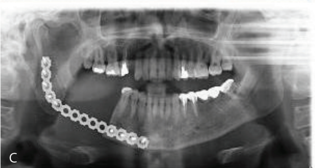
Figure 5. A. The pathologic lesion is entirely excised in one piece; B. Clinical view during bone resection; C. Radiographic view after bone resection.