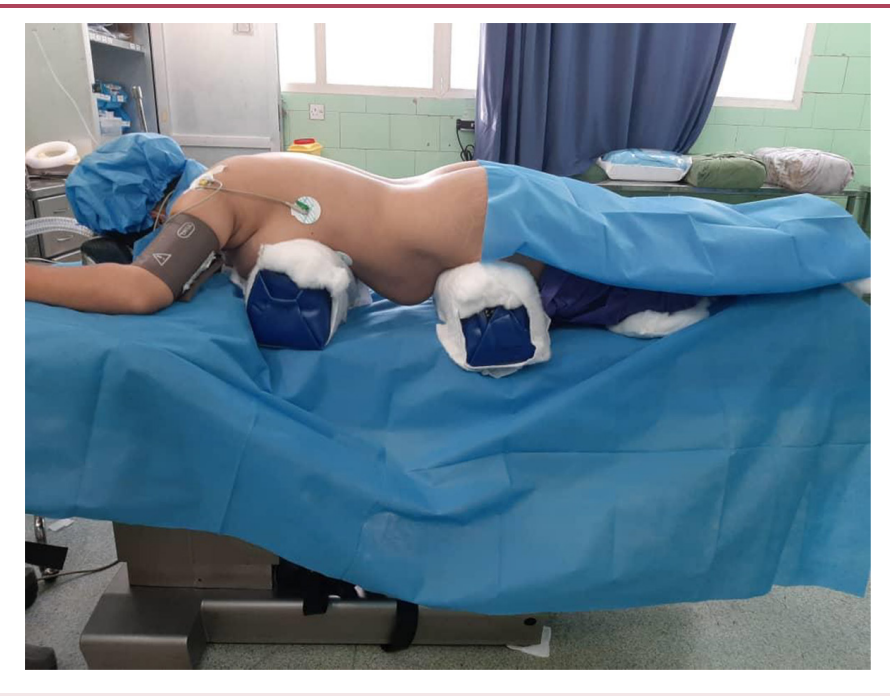
Figure 1: Patient position

Kruskal Wallis was employed to find the effect of delay to surgery on the kyphotic correction after postural and instrumental reduction with respect to AO fracture type. P<0.05 was considered to be statistically significant.