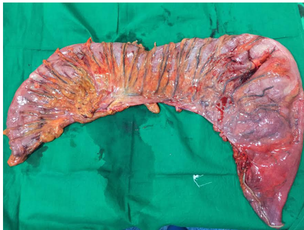
Figure 4. Resected Sigmoid Colon

tients may exhibit nonspecific GI symptoms including epigastric discomfort, belching, etc. (11).