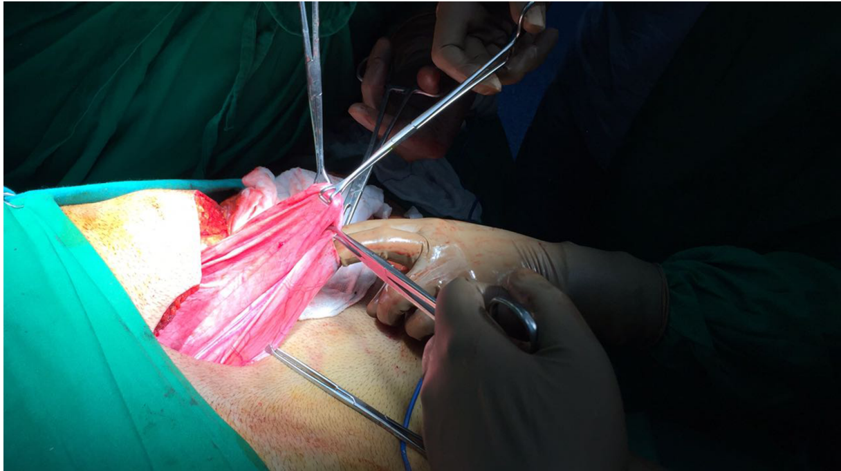
Figure 3. Left Subcostal Incision