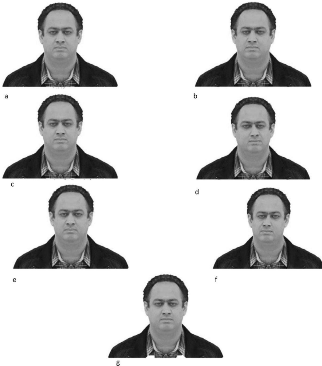
Figure 1: Examples of male volunteer faces with various levels of asymmetry. a: symmetric face; b: 4mm asymmetry to the right; c: 1mm asymmetry to the left; d: 6mm asymmetry to the left; e: 2mm asymmetry to the right; f: 8mm asymmetry to the right; g: 3mm asymmetry to the left