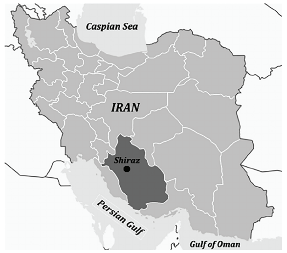
Figure 1: Map of Iran, showing Shiraz city in Fars province, Southern Iran

Shiraz, capital of Fars province, is the sixth densely populated city in Islamic Republic of Iran. It has a moderate climate and an average height of 5200 ft. above the sea level (Figure 1).