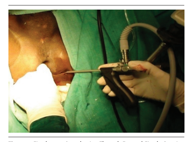
Figure 2. Fistuloscope Introduction Through External Fistula Opening During Video-Assisted Anal Fistula Treatment (27)

In the last decade lots of articles have been published about AFP. According to articles, there are variable success and failure rates of AFP reported (29). According to some studies from USA (30-32), China (33) and Italy (34, 35) the success rate of AFP was between 25-85%. Some studies point out that the success rate depends on factors like multiple prior attempts for closure (36), pervious surgery (37, 38), incontinence (39), complicity of fistula (40), cost