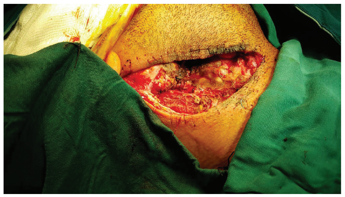
Fig. 3 The intraoperative image demonstrating the aneurysm in distal segment of the internal carotid artery after reoperation.

internal carotid artery without any aneurysm residue. The patient received anticoagulation for 3 months and was followed in outpatient clinic. After 1 year of follow-up he was completely asymptomatic and the angiogram revealed patent parent vessel without residue. The patient and his family provided their informed written consent for publication of the case and the images.