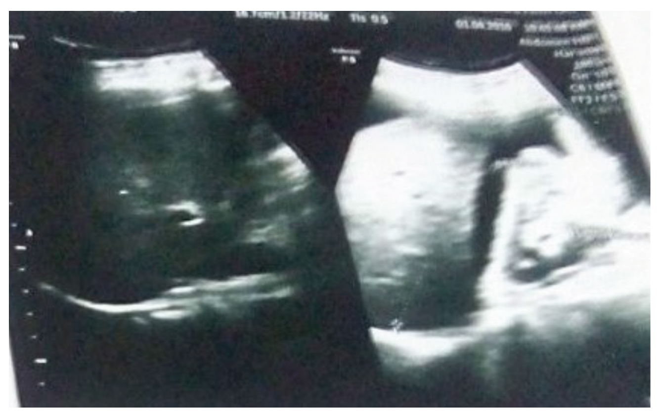
Figure 1. Ultrasonography revealing endometrial heterogeneous echogenicity; however, no evidence of focal thickening and normal adnexa.

A 45-year-old female presented to gynaecologic outpatient department with complaint of abnormal uterine bleeding as menorrhagia for 5 months. A diagnostic work-up was initiated to detect possible causes of vaginal bleeding. She underwent transvaginal ultrasound, which revealed endometrial heterogeneous echogenicity; however, no evidence of focal thickening, myometrium, and adnexa were unremarkable (Figure 1). Therefore, she underwent a dilatation and curettage (D&C) biopsy for tissue diagnosis of the endometrium. Pathological assessment of the endometrial tissue revealed isolated or sheets of neoplastic epithelial cells infiltrated within endometrial stroma and glandular formation at places, which is not typical