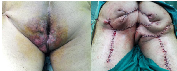
Figure 2. Perianal Lesion Before and After Surgical Removal

Colonoscopy was also performed for complete evaluation and found no other lesions. Finally, the patient became candidate for surgical treatment with the diagnosis of perianal Paget's disease. Therefore, perianal lesion was removed with wide excision and margin of at least 20 mm. Bilateral posterior gluteal thigh flap was used for the reconstruction for the created defect. Due to the use of wide flaps in perianal region, loop sigmoid colostomy was performed for fecal diversion. Considering to the marginal involvement of the excised region reported by pathologist, re-excision of involved part was performed in the second operation (Figure 2). He had no recurrence or complications in a follow-up period of 24 months.