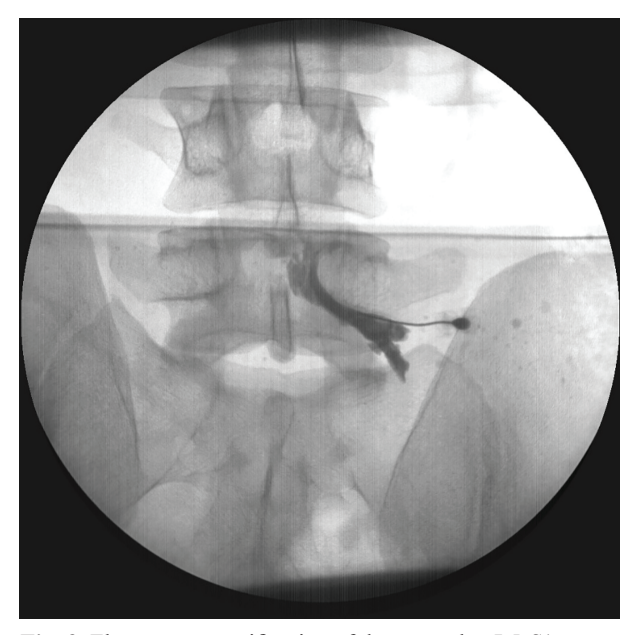
Fig. 3. Fluoroscope verification of dye spread at L5-S1.