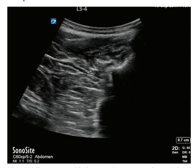
Fig. 1. Ultrasonographic image – Transverse view at L3-L4 foramen.