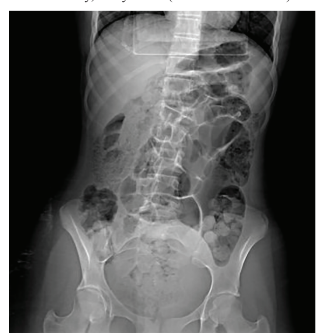
Fig. 1. Plain abdominopelvic radiography demonstrating generalize dilatation in small intestine and colon.

A 15-year-old non-addict girl was referred to Imam-Reza toxicology center from the secondary care hospital, due to ingestion of some packets containing about 5 gr of MET. Her purpose was not clear, whether she was a body packer or a body stuffer. Her parents took her to hospital because of complaining about abdominal pain, nausea, vomiting, constipation and obstipation about 12 hours after ingestion. The physicians found general ileus on their primary evaluation. At the time of admission, she was alert with normal vital signs however she suffered from general dull abdominal pain, nausea and anorexia. On physical examination, she had generalized abdominal tenderness without rebound. Her bowel sounds were decreased, (silent abdomen) and her rectum was empty on digital rectal examination. The abdominal plain radiography showed generalize dilatation in small intestine and colon (Figure 1). However, she had normal serum electrolyte (Table 1). Physicians considered a general ileus, therefore she was treated by intravenous metoclopramide 10 mg every 8 hours and erythromycin 400 mg every 6 hours. Her vital signs were monitored and she was treated by regular intravenous fluid and electrolytes. A 16 F nasogastric tube was inserted and fixed. On next morning, she became restless (Richmond Agitation-Sedation Scale= +2) with stereotyped motor activity, tachycardia (Heart rate=120/min) and