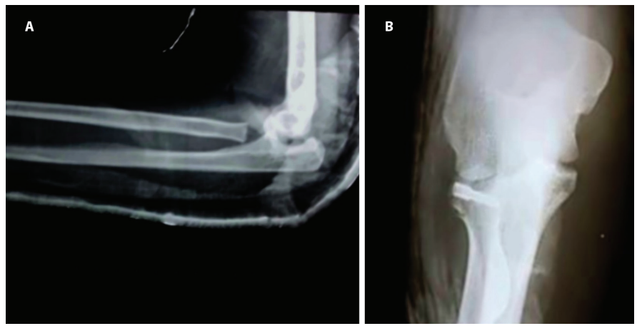
Fig. 2. Postoperative radiography of Mason III fracture managed with resection (A); postoperative radiograph of Mason II fracture managed with reconstruction with screws (B).