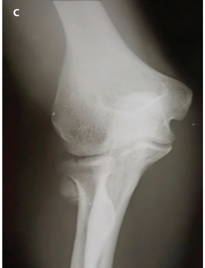
Fig. 1. Preoperative lateral radiograph of a patient with Mason III fracture (A); 3D-reconstructed CT-scan of Mason III injury showing comminution (B); preoperative anteroposterior view of a Mason II fracture (C).