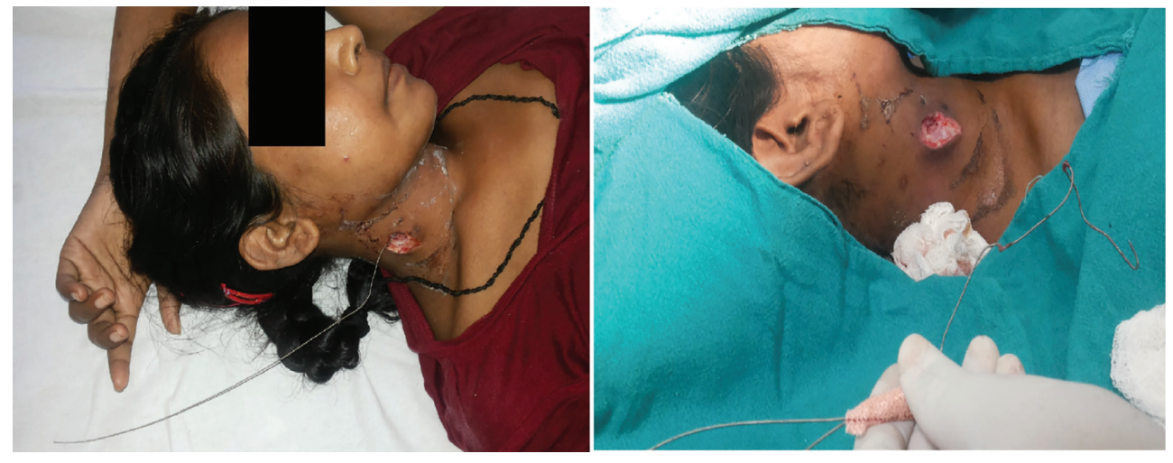
Fig. 2. Guide wire before and after extraction.