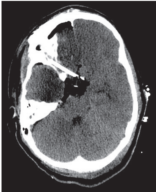
Fig. 3. Postoperative brain CT-Scan demonstrating relaxed brain with decreased edema along with pneumocephalus and a ventriculostomy catheter placed in basal cisterna.