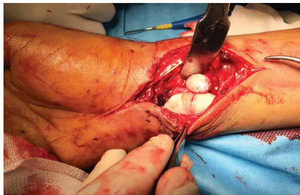
Fig. 2. Intraoperative image of volar approach used to decompress carpal tunnel and primary reduction of the carpus. Capitae is placed in volar aspect of distal radius and the effect of intensive pressure on the carpal tunnel is remarked.

dislocation. Then, dorsal approach was used to open wrist joint capsule from among extensor tendons and the reduction was done using two approaches. It was fixed using several pins. The approach is centered over Lister's tubercle, reflecting the dorsal wrist capsule to preserve the dorsal intercarpal and dorsal radiotriquetral ligaments, using a radial-based capsular flap. The radial capsule is reflected from the scaphoid to its waist. The open technique allows direct visualization of the injured ligament, reduction, and ligament repair (Figure 2).