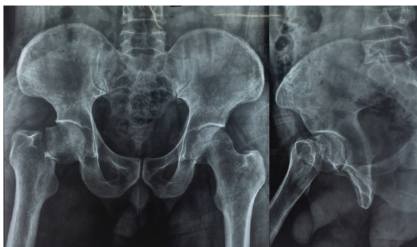
Fig. 1. Preoperative radiography of a patient demonstrating a Garden type 3 and Pauwels type 3 femur neck fractures.

This is a cross-sectional study including 7 patients with neglected femoral neck fracture (Figure 1) referring to Mahatma Gandhi Mission (MGM) university hospital between 2012 and 2015. All the patients were operated within a month of intracapsular neck femur fractures, with TFL muscle pedicle bone grafting. The interval between injury and operation was 4 weeks in 3 cases and 2 weeks in 4 cases. Open reduction and internal fixation with 6.5 mm cannulated cancellous screws was augmented with tensor fascia lata muscle pedicle graft which was fixed across the fracture site by 4 mm screws. In supine position, Smith Peterson approach was taken and the fracture site was approached after giving a T-shaped incision over the capsule. Freshening of the fracture site bone edges was done. Fracture was reduced and through another lateral incision over the greater trochanter. Two 6.5mm cannulated cancellous screws were put to fix the fracture. The tensor fascia lata origin from iliac crest was identified and using saw the graft was removed. The graft was fixed across the fracture site using 4 mm screws and in 5 cases a small 5mm to 10mm part of anterior femoral head was chiseled to adapt the graft across the neck properly. Adequate coverage of the neck by the capsule was ensured (Figure 2). Wound was closed over drain. Patients were mobilized non-weight bearing with