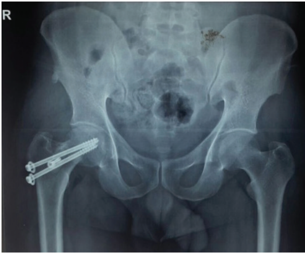
Fig. 4. Anteroposterior view of the femur at 3-year follow up after fascia lata muscle pedicle bone grafting in the same patient demonstrating good bony consolidation