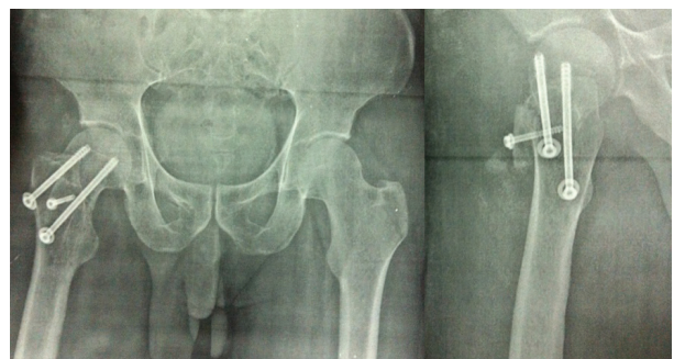
Fig. 3. Anteroposterior and lateral view of the femur at 1-year follow up after fascia lata muscle pedicle bone grafting in the same patient.

Femoral head viability is always of concern in fracture of femoral neck [1,2]. Complications include persistent nonunion, avascular necrosis, collapse and arthritis [8]. We had one collapse making the overall percentage of complication as 14% after 3 years. Those 6 patients which united went ahead to live a pain free life without restriction of any activities of daily living (ADL) even up-to 3 years of follow-up. Vascularized bone grafting on a muscle pedicle such as gluteus medius, quadrates femoris, or Sartorius is also an established method of treatment quoted in literature [9-11]. The advantages of TFL muscle-pedicle bone grafting [12] over others is as follows: