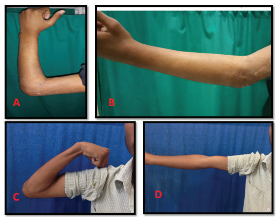
Fig. 3. Range of motion at elbow joint; A: Flexion at 6 weeks; B: Extension at 6 weeks; C: Flexion at final follow-up; D: Extension at final follow-up.

There are many approaches to explore distal end humerus like anterior approach called Henry's approach, the lateral approach called Kocher's approach, and posterior approach. The anterior approach to the elbow is rarely used for the internal fixation of adult distal humerus fractures [8,9] because it provides little access to the medial and lateral columns for the application of internal fixation. Close proximity to the neurovascular structures and inadequate exposure are some of the drawbacks for this anterior approach. The Kocher approach involves identification of the interval between extensor carpi ulnaris (ECU) and anconeus [10]. This lateral Kocher's approach limits the exposure of the medial column. Posterior approaches used most commonly are olecranon osteotomy, triceps splitting (Campbell), triceps dividing (TRAP, Van Gorder), triceps sparing. Each approach has its own indications and contra indications. Surgeon's preference is one of the important factors for the