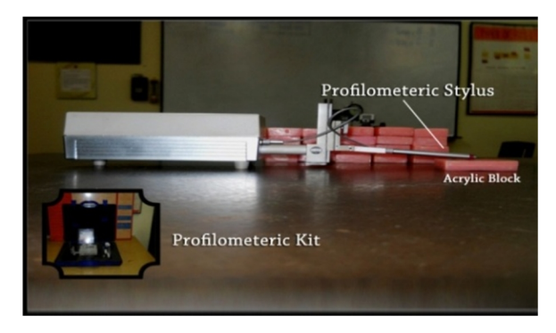
Figure 2: Profilometric kit along with the profilometer

The mean surface loss was evaluated using a profilometer. It provides Ra value (average surface roughness) and difference in Ra value before and after tooth brushing provides proxy measure for assessing surface abrasion. The Ra value for all the 45 mounted enamel specimens were calculated prior and post to tooth brushing and the difference in Ra value (Post-Pre) was used to assess change in surface roughness/ abrasion (Figure 2).