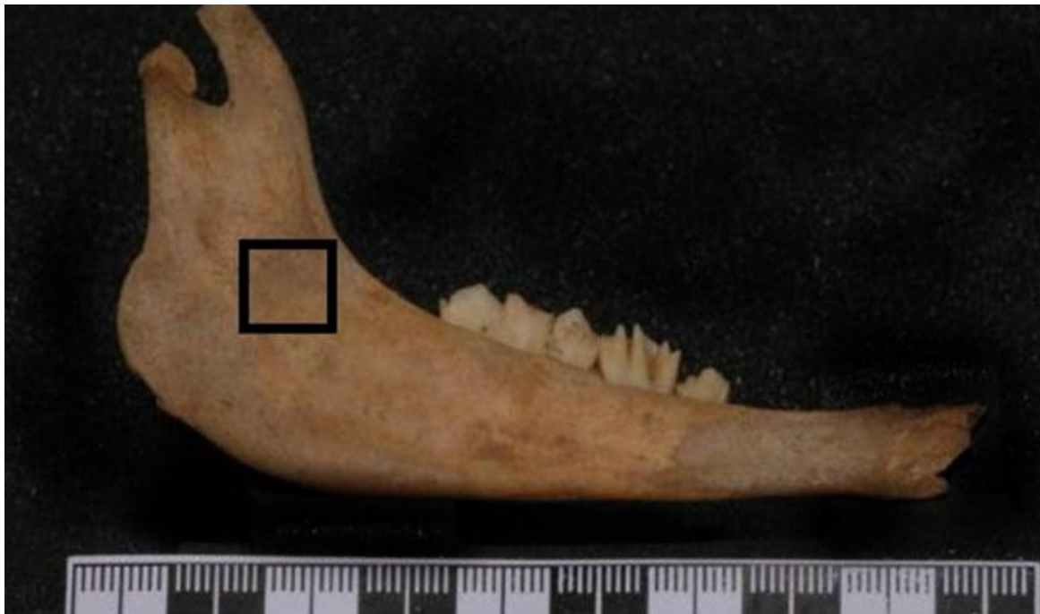
Figure 1: Gutta-percha cones were used to form a square window (1×1cm) on buccal surface of mandibles.

This research was carried out on 26 samples of mandibles of sheep. All soft tissues were removed from the mandible. Gutta-percha cones were used to form a square window (1×1cm) on buccal surface to enable precise selection of the areas on each sample (Figure 1). The samples were put into a container of melted wax for covering all the surface of samples with a thin layer of wax. This was done to simulate soft tissue and to avoid direct contact of air with the bone in order to postpone decay. Wax layers were used with various thicknesses within the range of 10-20 mm.