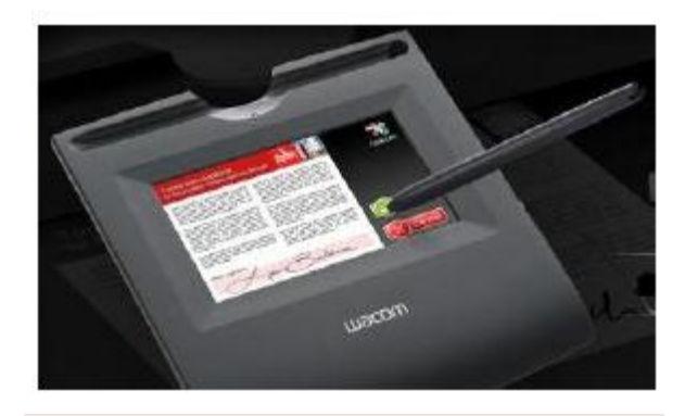
Figure 2: Optical pen and the digital tablet used in this study (STU 520A)

ucational levels (from high school diploma to doctoral degree). When the participants drew the shapes (Figure 1) by the optical pen on the digital tablet, STU 520A took their following five features simultaneously: pressure, time, angels with the perpendicular and horizontal axes and velocity.