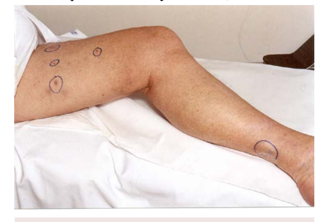
Figure 3: 20 of 21 melanomas completely regressed after systemic TAT. The initial sizes of the larger tumours are shown as blue rings. Post-TAT tumour beds revealed a complete absence of viable melanoma cells.

The observation of efficacy at quite low doses showed that this trial, while adequate as a phase 1, was inadequate to investigate the underlying factors that were contributing to the unexpected efficacy. As such, the trial was