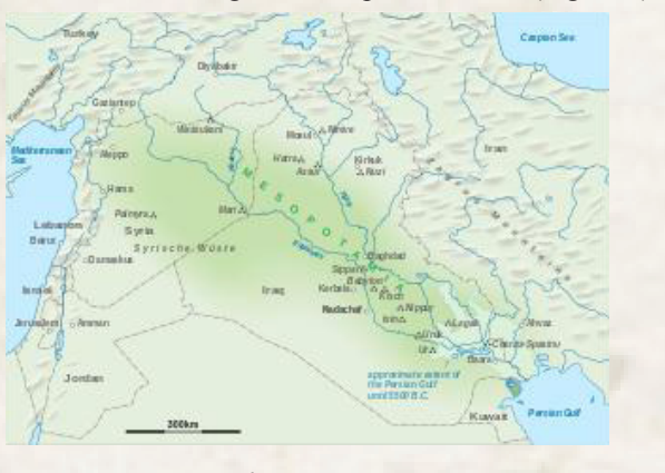
Figure 1. Mesopotamia

Mesopotamia is one of the oldest cradles of human civilization in the world. It is located between Tigris and Euphrates rivers (Figure 1).