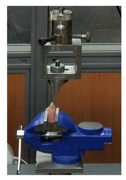
Figure 1: The specimen under the shear bond strength test using the Universal Testing Machine.

Then, the specimens were rinsed in water for 30 seconds and dried. Finally, resin composite restoration procedure was performed. Bleached enamel surfaces of specimens were etched by 37% phosphoric acid gel for 15 seconds (Total Etching Gel, IvoclarVivadent, Schaan, Liechtenstein). Then, they were rinsed with water spray for 15 seconds. Application of Adper Single Bond (3M ESPE, Dental Products, St Paul, MN, USA) was done and light-curing was performed by an LED unit (Demi Plus, Kerr, Switzerland) for 20 seconds at a light intensity of 1200 mW/cm<sup>2</sup>. Finally, resin composite (Filtek Z350, 3M Dental Products) restoration procedure was carried out by using a Teflon mould measuring 5mm × 2mm in cured for 20 seconds.