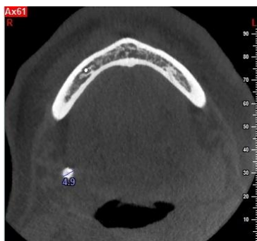
Figure 2: Measuring calcification with CBCT software