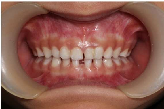
Figure 1: The intra-oral view. Fusion between the primary maxillary left lateral incisor and lateral supernumerary tooth is evident.

In intraoral examination, bilateral supernumerary primary maxillary lateral incisors were found (Figure 1). In the left side, fusion was found between the primary maxillary left lateral incisor and the lateral supernumerary tooth (Figure 1).