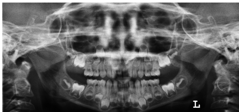
Figure 3: The panoramic radiograph shows no evidence for presence of supernumerary permanent tooth germ in the anterior region. However, rotation of the permanent central teeth germs and development of dens invagination in permanent maxillary right central incisor are suspected.

Root resorption is extremely rare in these cases. In many cases, supernumerary teeth are not associated with any problem. They may be accidentally detected in dental examination or may be found during routine radiograph-