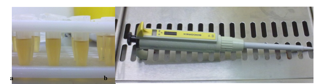
Figure 1a Eppendorf tubes containing TSB solution b Sampler tool used for both contaminating and sampling of the teeth