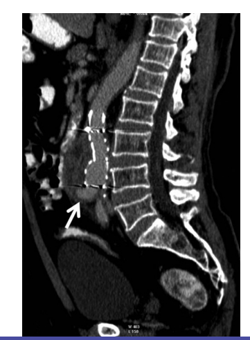
Figure 2: Sagittal reformat contrast-enhanced computed tomography images show the growing aneurysm sac by type 1B endoleak and the expanding tubular stent graft at the distal end due to the growing aneurysm.

The patient was admitted to the emergency room with a septic syndrome after 14 months. Laboratory values demonstrated leukocytosis, neutrophilia, and increased C-reactive protein and sedimentation levels. Creatinine and bilirubin levels were also above normal values. Abdominal CT scan showed that the left-sided psoas abscess had grown to 9 cm in diameter and contained air fluid levels. The horizontal segment of the duodenum was adhered to the perigraft infectious tissue (figure 3). Therefore, stent graft explantation, extensive surgical debridement, aortic ligation, and extra-anatomic right axillofemoral bypass graft reconstruction were performed. The psoas abscess was drained with a percutaneously placed large-bore catheter, and intravenous antibiotherapy was