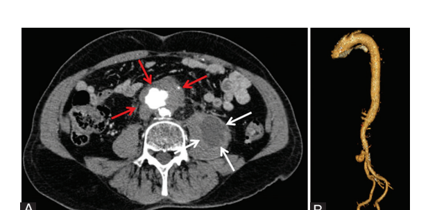
Figure 1: (A) Axial computed tomography angiography image of the irregularly shaped, saccular mycotic infrarenal abdominal aortic aneurysm (red arrows) and the left-sided psoas abscess (white arrows) is presented here. (B) Threedimensional view of the mycotic aortic aneurysm is depicted.

The patient was admitted to the hospital with the same complaints 3 months after EVAR. Abdomen CTA examination showed growth and pressurization of the aneurysm sac by type 1B endoleak (figure 2) and expansion of the tubular stent graft at the distal end due to the growth of the aneurysm. The patient was retreated with a bifurcated stent graft. A main body (25–13–120 mm, Endurant–Medtronic) and a contralateral limb (16–13–80 mm, Endurant–Medtronic) were implanted. Both limbs of the stent grafts were dilated simultaneously with a 10-mm balloon.