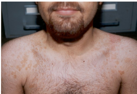
Fig 1: Brown colored maculae caused by an isolate of Malassezia furfur on the neck and upper trunk in a patient with pityriasis versicolor.

Demonstration of round to ovoid yeast cells and short filaments in scales from patients is considered to be the most diagnostic finding in direct microscopy of all Malassezia infections. 8 Identification of Malassezia spp, specially unstable morphologic forms such as M. furfur using routine morphological and physiological techniques is laborious, time consuming and costly. 2,9-11 M. furfur is considered as one of the most prevalent species involved in the etiology of different Malassezia infections, especially pityriasis versicolor. Its high morphological variation in direct microscopy requires a rapid identification of this species among Malassezia isolates. This is of practical importance in epidemiological studies. In present study, a simple and reliable method was successfully used for differentiation of M. furfur from all other known Malassezia spp. based on the ability of pigment production.