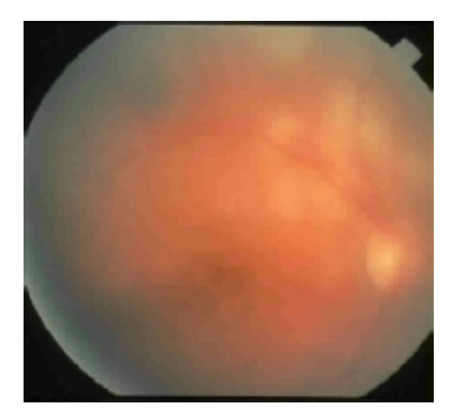
Figure 1: Multiple creamy yellow-white lesions at the level of the retinal pigment epithelium, superior to the optic disc and in the superior arcades. (Reproduced with permission from <u>www.uveitis.org/images.)</u>