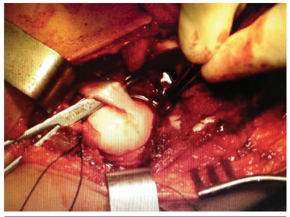
Figure 1: Intra-operative picture showing the dislocated hip and the round ligament just before resection.

Six children were excluded from the final study due to the previous surgical procedures. Among