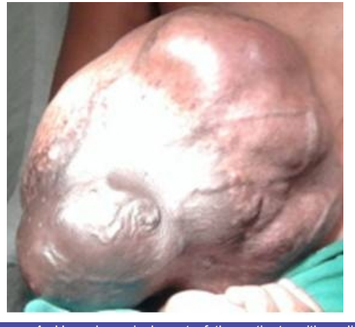
Figure 1: Huge lump in breast of the patients with malignant phylloides tumor during pregnancy.

her description till the 28<sup>th</sup> week of her pregnancy. It began to grow rapidly in size, practically in days, and at the time of presentation was as large as a football (figure 1), and was causing pain for the patient. Examination revealed a characteristically ill-shaped swelling with variegated consistency. It was so large and heavy that required the support by her hands during moving around (figure 1). The axillae and opposite breast revealed no significant findings. The patient had also a uterine prolapse since few days after marriage (figure 2). Fine needle aspiration cytology was positive for malignancy, chest X-ray with shield was normal, and ultrasonography of abdomen for metastases was normal.