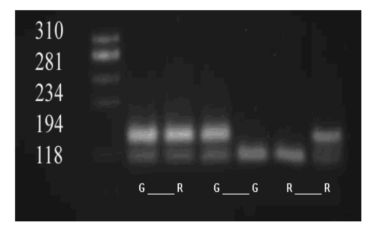
Figure 1. PCR products of codon 241 G to R substitution in ICAM-1 gene. A 100 bp internal control fragment was amplified in each reaction. After DNA size marker in the left hand side there are samples from a heterozygote case in lane 1 and 2, G/G homozygote case in lanes 3 and 4, and R/R homozygote case in last two lanes.

Amplification of exon 4 of the ICAM-1 gene. An allele specific PCR method (ARMS) was used to amplify a 137 bp fragment of ICAM-1 gene exon 4 using the appropriate primers. The primer sets consisted of Primer G: 5GTGGTCTGTTCCCTGGACG3; Primer 5GTGGTCTGTTCCCTGGACA3 R: and common primer: a 5GCGGTCACACTGACTGAGGCCT3. For each individual two distinct PCR reactions were performed, one with primers G and the common primer and another with primers R and the common primer. Approximately 300 ng genomic DNA was amplified in a total volume of 25 µl of the reaction mixture containing 2.5 µl of 10X PCR buffer, 0.75 μl of 10 μM dNTPs, 0.75 μl of 50 μM MgCl2 (CinnaGen, Tehran, Iran), 1 μl of 20 ρM primers (TIB Molbiol, Berlin, Germany), and 2 unit of Taq DNA polymerase. PCR amplification was done using touch-down method including an initial denaturation at 94 °C for 5 min and two loops of amplification. Loop one included 10 cycles of 94 °C for 20 s, 69 \rightarrow 64C^{\circ} for 20 s, 72 °C for 20 s, and loop two included 20 cycles of 94 °C for 20 s, 61.5 °C for 20 s, and 72 °C for 20 s. Final extension was performed at 72 °C for 5 min. The amplified PCR products of 137 bp were run on 2% ethidium bromide stained agarose gel and visualized under UV transilluminator. (Figure 1)