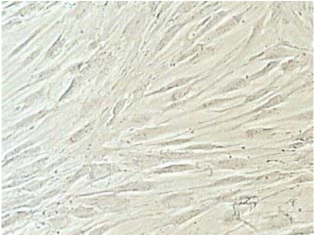
Figure 1. Mesenchymal stem cells in culture.

Immunophenotyping. At the end of the last passage, surface expression of CD166, CD105, CD44, CD13 (MSC markers), CD34, CD45 (HSC markers) and CD31 (endothelial cell marker) were determined in culture-expanded MSCs. Anti CD44, CD45, and CD34 fluorescein isothiocyanate (FITC), anti-CD13 and CD31 phycoerythrin (PE) all from Dako (Denmark), anti CD166 FITC and anti CD105 PE were purchased from Serotec (Italy). Relevant isotope control antibodies were also used. Flow cytometry was performed on a FACScan (Becton Dickinson) and data were analysed with Cellquest software. Typical flow cytometry profile and Immunohistochemistry staining of MSCs isolated from this study are shown in figures 1-3.