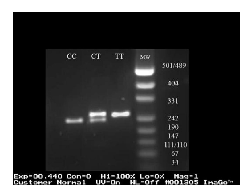
Figure 2. Genotyping of +1822 C/T SNP in CTLA4 intron 1 using PCR-RFLP technique and Hae III enzyme. TT: 257 bp, CT: 257, 237 and 20 bp, CC: 237 bp.