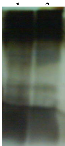
Figure 1. Silver stained SDS-PAGE profile of B. abortus S19 LPS.

Characterization of B. abortus LPS. As expected, purified LPS had a heterogeneous structure and appeared as a smear with two distinctive band zones (low and high molecular weight) on a silver-stained SDS gel (Figure 1) similar to the patterns previously reported for the LPS of B. abortus (26).