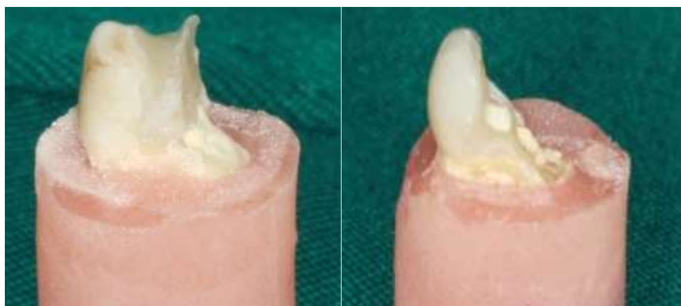
Figure 3: The samples of restorable/ non-restorable sample fractures. (A)restorable fracture; (B)non-restorable fracture

In our study, no significant difference in FR was observed between bulk-fill and conventional composite resin restorations. This finding was in agreement with result of the latter study as mentioned above [26]. However, Ghajari et al. [27] assessed FR of pulpotomized