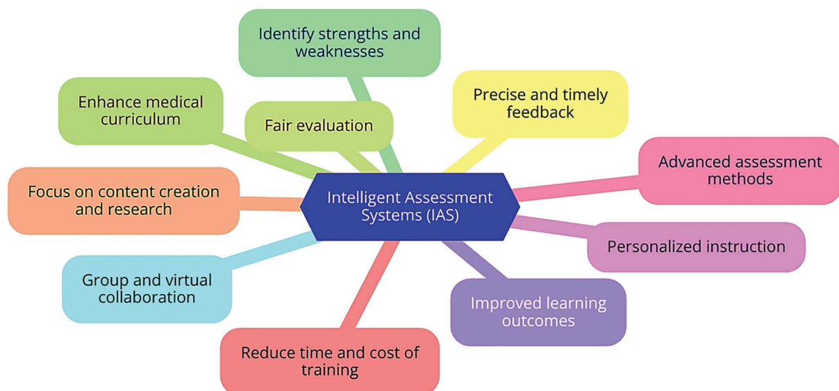
Figure 1: Mind Map of Key Concepts in Intelligent Assessment Systems (Authors' own work), Illustration of various benefits and applications of Intelligent Assessment Systems (IAS) in medical education

With the use of IAS, students can independently and automatically tackle various challenges in the field of medical sciences and compare their results with scientific standards. Additionally, by receiving regular and transparent feedback from IAS, students can identify their strengths and weaknesses and work on improving their performance (18-20).