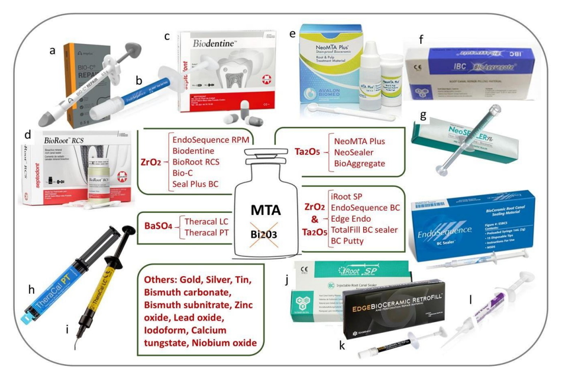
Figure 3: An overview of substituting bismuth oxide with other nontoxic, inert, and colorless substances, along with the introduction of some related non-staining products. a: Bio-C Repair, b: EndoSequence RPM, c: Biodentine, d: BioRoot RCS, e: NeoMTA Plus, f: Bio-Aggregate, g: Neosealer, h: Theracal PT, i: Theracal LC, j: iRoot SP, k: Edge Endo Bioceramic Retrofill, l: TotalFill BC sealer

mentioned [21, 87]. In several studies, bismuth oxide was substituted with other inert, nontoxic, and colorless compounds including gold powder, silver/tin alloys, bismuth carbonate, bismuth subnitrate, barium sulfate, zirconium oxide, zinc oxide, lead oxide, iodoform, tantalum, and calcium tungstate [56, 81].